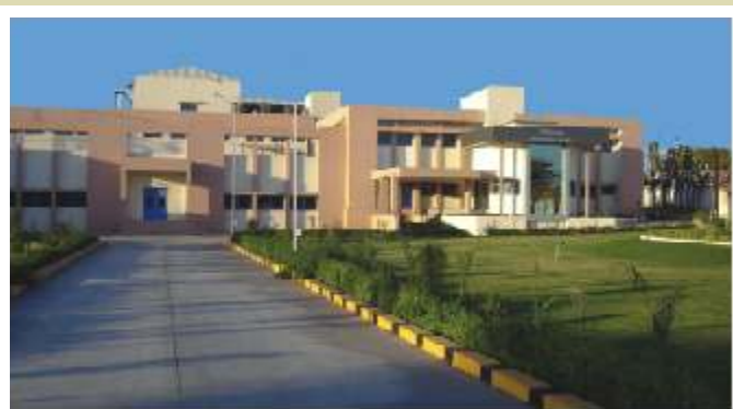
Pharmaceuticals Vikram Thermo (P) Ltd.