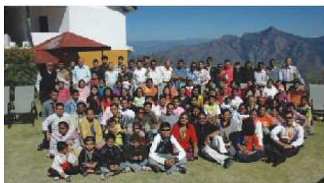
Invigorating Tour to Manali