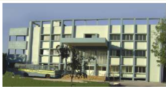
Office Building Blind Peoples' Association