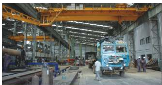
Heavy Engineering ISGEC Ltd.