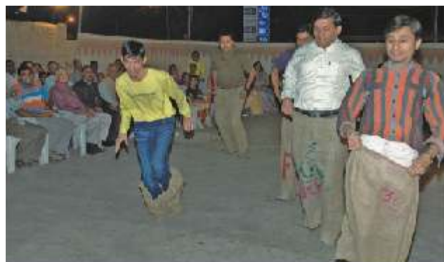
Frog Jump Enjoyed by all