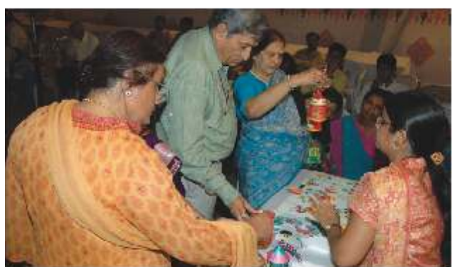
Co-sponsoring Handcrafts making and Computer Classes for Girls