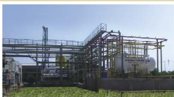
Textile - Speciality Mercerising Arvind Mills