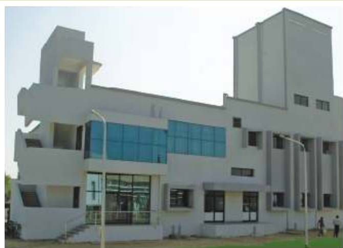
Bulk Drug Industry BGP Health Care Pvt. Ltd.