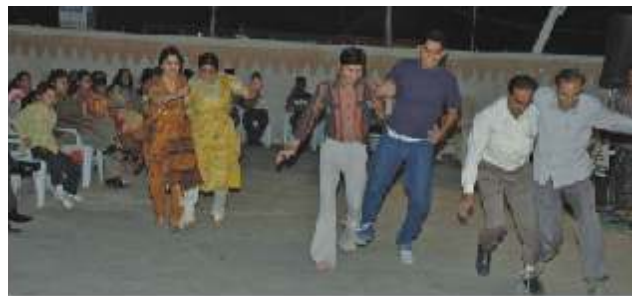
Three Legged Race