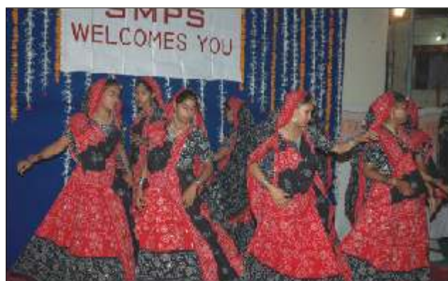
Ras, Garbas and Folk Dances during Navratri Festival