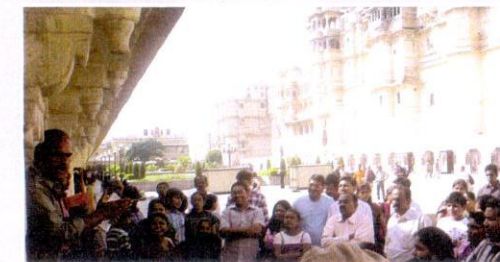
▲ Rajasthan Tour - SMPS Office Personnel