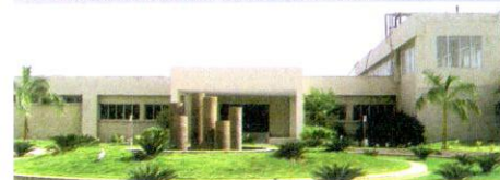
▲ Nirma Healthcare - Greater Ahmedabad New Pharmaceutical Formulation Plant