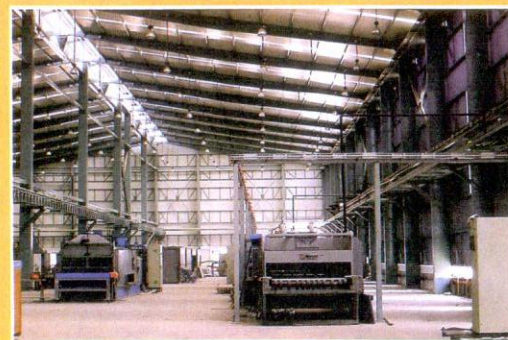
▲ TTK Prestige Limited - Karjan Near Baroda (Gujarat) Green Field Cookware Manufacturing Plant