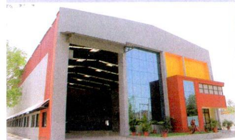
▲ Mazda Limited - Greater Ahmedabad Heavy Engineering Plant