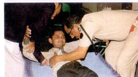
Training for Accidents imparted by a Police Officer