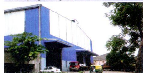
▲ AIA Engineering Limited - Greater Ahmedabad A Large Foundry and Machine Shop