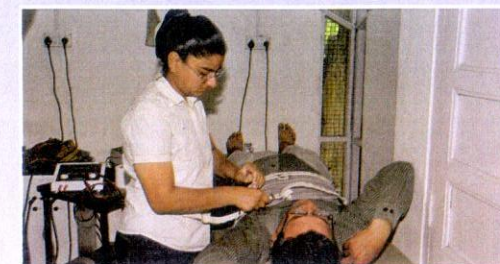
▲ Assistance to Physiotherapy Centre Treatment in Progress