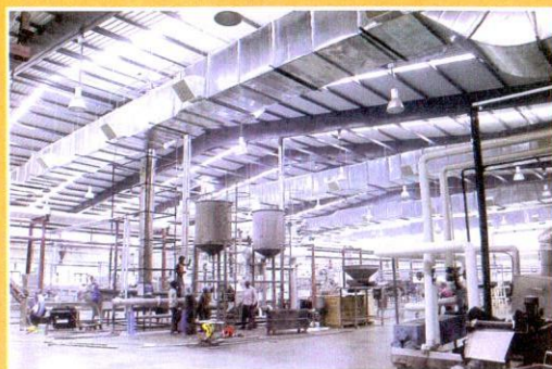
▲ Cavinkare Pvt. Ltd. - Greater Mumbai Green Field Food Processing Plant