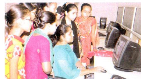
Training School Girls in Computer Field