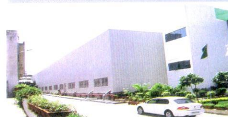
▲ Tech Textile (A Division of Neo-Corp. International Ltd.) Non-Woven Textile Plant - Pithampur (Madhya Pradesh)

Poggehamp Nagarsheth Powertronics Pvt. Ltd.