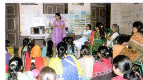
Cooking class for Women