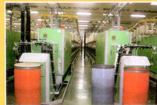
▲ Mafatlal Denim, Textile Plant, Navsari (Gujarat)