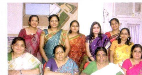
▲ Celebrating Women's Day at SMPS Office