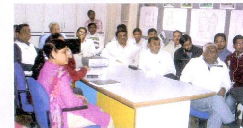
▲ Inhouse Training Seminar at SMPS Office