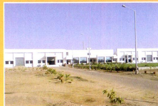
▲ Cera Sanitaryware New Faucetware Production Plant, Greater Ahmedabad