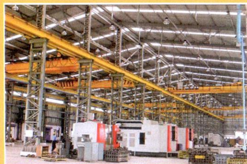
▲ Steelcast Limited - Bhavnagar (Gujarat) A Large New Alloy Steel Foundry