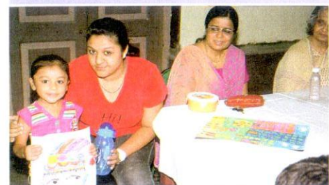
Painting Competition for Young Children